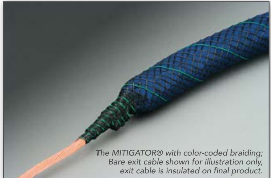
The MITIGATOR® with color-coded braiding; Bare exit cable shown for illustration only, exit cable is insulated on final product.