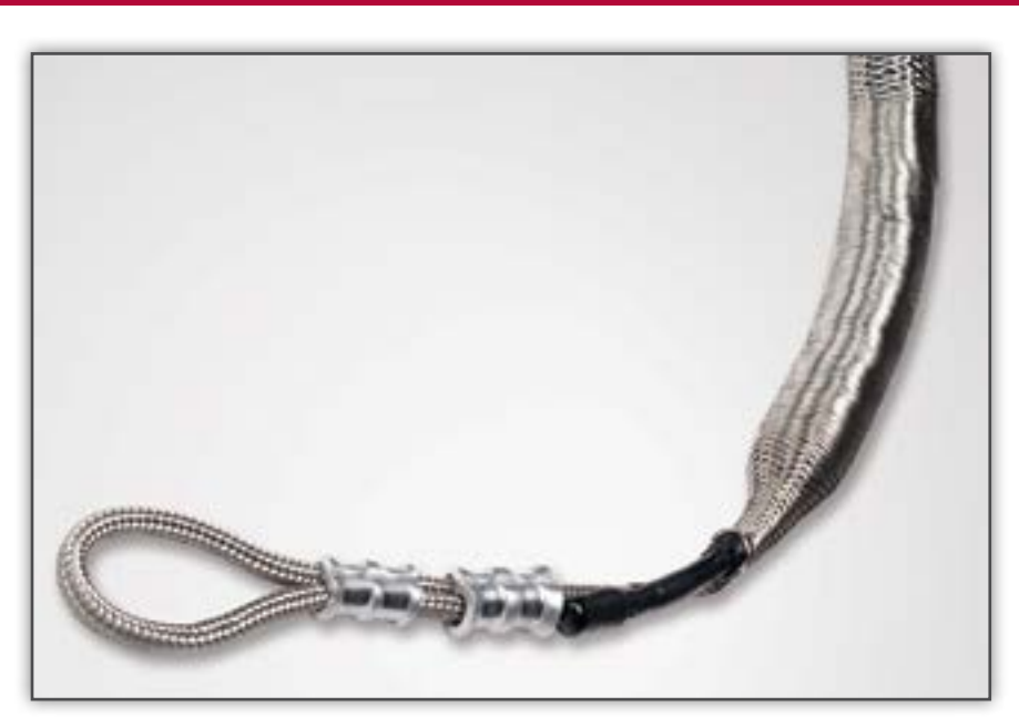
Iron Gopher® is the only linear anode designed for cathodic protection in horizontal drilling (HDD) applications.

Dual End Model: The main insulated cable is looped back inside the braiding and two cable ends exit one end of the linear anode wrapping. This is ideal when power can only be connected to one end of the anode.