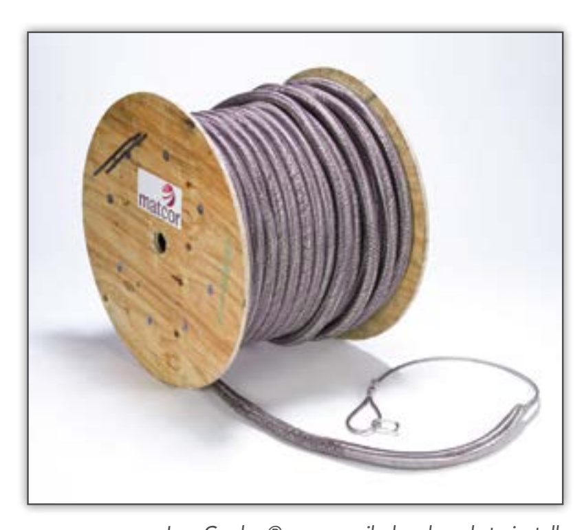
Iron Gopher® comes coiled and ready to install.

The Iron Gopher linear anode is factory assembled and ready to install. Simply attach the linear anode to the HDD reamer with Iron Gopher's integrated pulling loop, and pull through the hole with confidence that the strongest linear anode is in place for the best HDD cathodic protection.