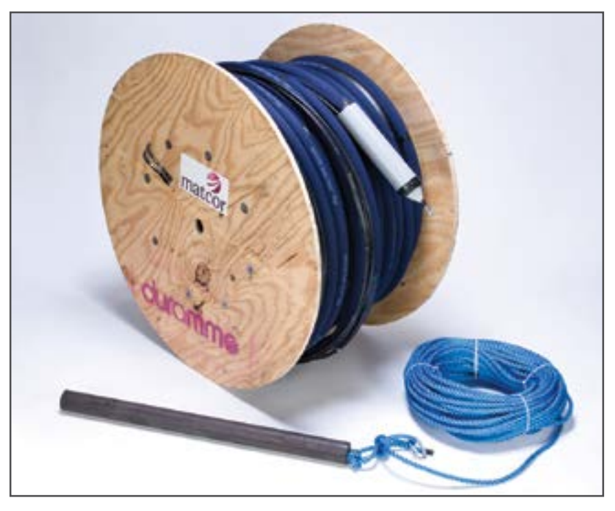
SuperVent<sup>™</sup> comes coiled and ready to install.

MATCOR engineering is ready to assist with your specifications and product selections.