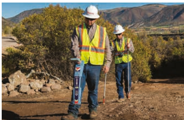
Figure 2. CIPS crew gathers potential data along pipeline ROW.

The first is the -850 MV polarised potential criteria. NACE deems any pipeline that has a negative polarised potential of -850 MV to meet the criteria for effective