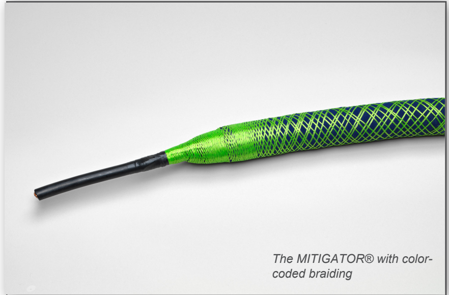
The MITIGATOR® with color-coded braiding

See the specification chart for additional information.