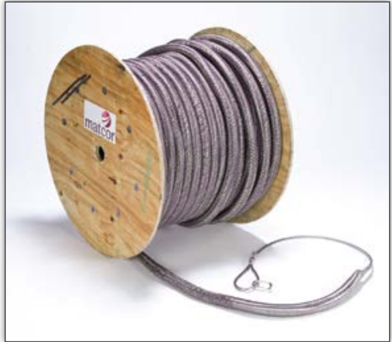
Iron Gopher® comes coiled and ready to install.

The Iron Gopher linear anode is factory assembled and ready to install. Simply attach the linear anode to the HDD reamer with Iron Gopher's integrated pulling loop, and pull through the hole with confidence that the strongest linear anode is in place for the best HDD cathodic protection.