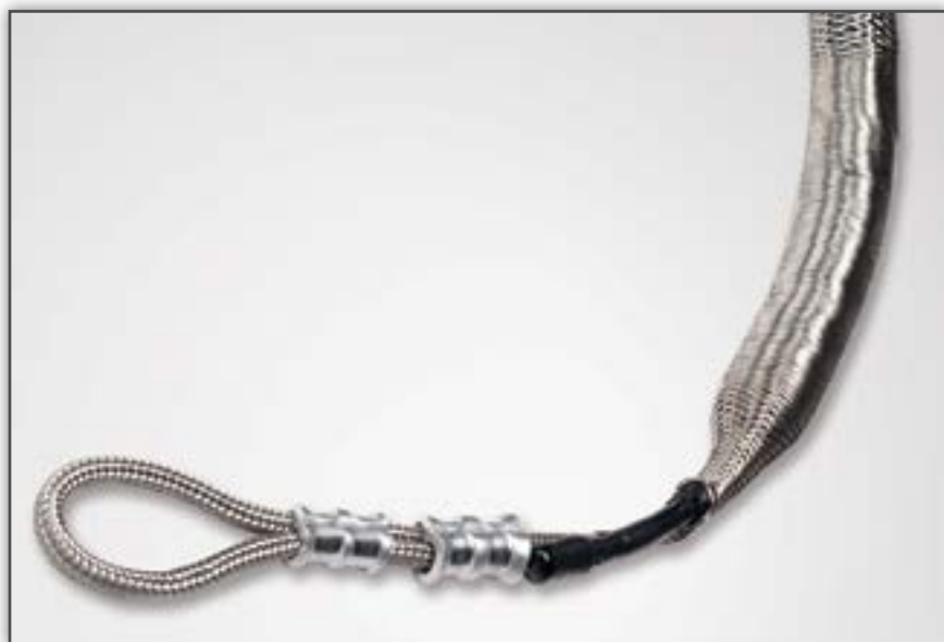
Iron Gopher® is the only linear anode designed for cathodic protection in horizontal drilling (HDD) applications.

Iron Gopher is the only linear anode designed specifically for cathodic protection in horizontal directional drilling (HDD) applications. Iron Gopher is patent-pending and features a superior strength stainless steel braid and aircraft pulling cable with an integral pulling loop. Inside Iron Gopher is MATCOR's braided SPL™-FBR-Anode with patented Kynex® connections. There is no better linear anode for HDD applications.